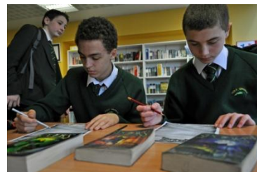
Boys completing Spooks Quiz