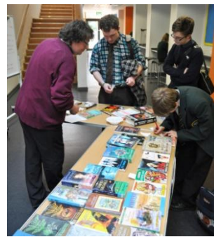
Book Swap – with 6 th -former showing an interest...